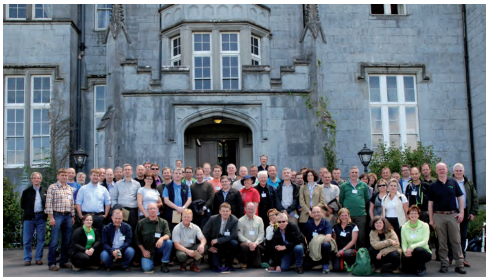
Delegates at Kinnitty Castle during a field trip which visited several of Coillte's establishment and harvesting sites in the Slieve Blooms.

Coillte hosted the 2014 European State Forest (EUSTAFOR) annual conference which was attended by more than 50 delegates representing state-owned forest companies and agencies across Europe. The theme of the conference was "Managing highly productive forests in a changing world".