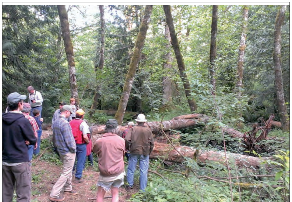
A group of private forest owners examines a log placement project in Oregon that received co-funding and support from state and federal agencies. Recognition of the value of large woody debris in river ecosystems has seen a reversal of management practices from keeping rivers clear to deliberately adding logs and tree root wads in strategic locations.