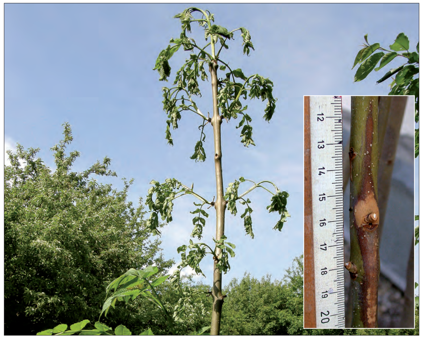
Chalara ash dieback can be detected in bark and foliage: lesion or scar on young ash stem is a sign of the disease (inset). When ash trees come into leaf, the Chalara disease is easier to identify. Symptoms include wilting of foliage, leaf discolouration later turning to black.

Society makes submission to All Ireland Chalara Control Strategy