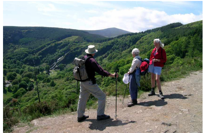
Walkers enjoying the view of Powerscourt Waterfall, near Enniskerry, County Wicklow

In Ireland, there is no legal right to roam on private land and